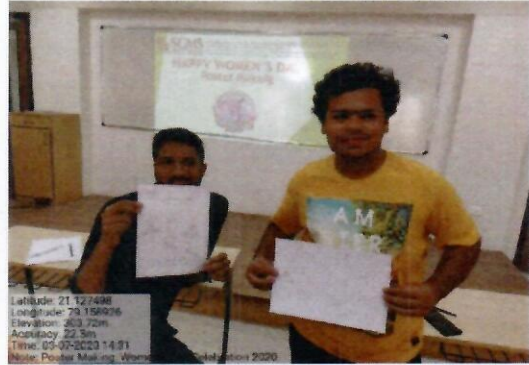
Latitude: 21.127498 Longitude: 79.159026 Elevation: 393.72m Accuracy: 22.5m Time: 09-07-2020 14:31 Note: Poster Making: Women's Day Celebration 2020