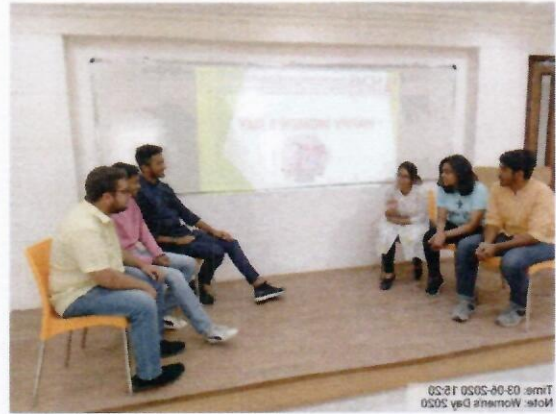
Time: 09-06-2020 12:50 Note: Women's Day 2020