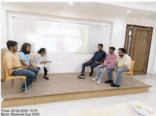
Time: 09-06-2020 15:19 Note: Women's Day 2020